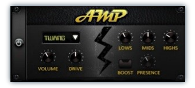
Highs - This knob controls the gain of high (treble) frequencies.

Mids - This knob controls the gain of mid-level frequencies.