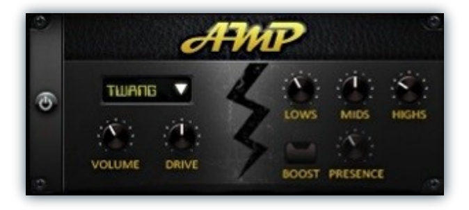
Highs - This knob controls the gain of high (treble) frequencies.

Mids - This knob controls the gain of mid-level frequencies.